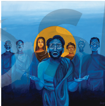
UNBIND ME BY LAUREN WRIGHT PITTMAN INSPIRED BY JOHN 11:1-45

—Powery, Luke. “Revival 1. Lectionary Commentary.” Published on The African American Lectionary . August 17, 2008. http://www.theafricanamericanlectionary.org/PopupLectionaryReading.asp?LRID=39 .